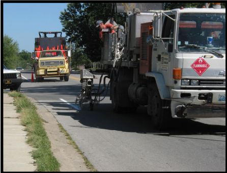
Linear feet striped 4,320