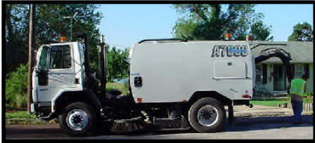
Lane miles swept 1,810