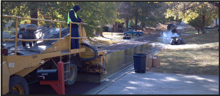
Asphalt Patching & Overlay 4,017 tons